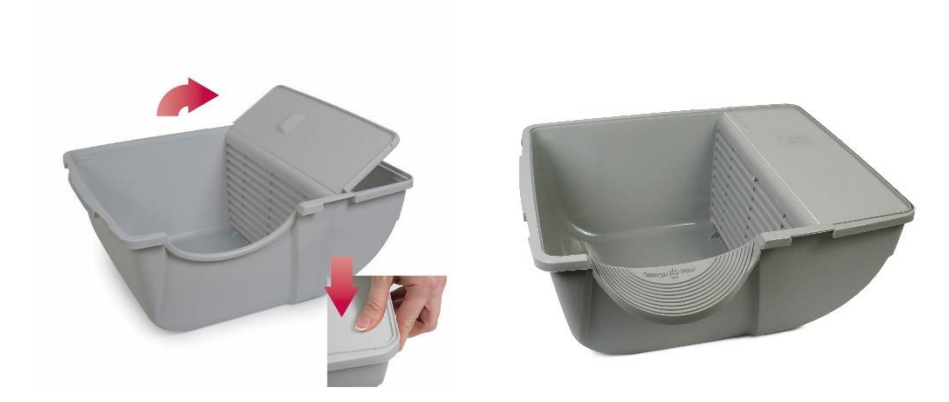
Second: line up the top of the litter box, with the bottom portion, ensuring the locking clips line up with the slots on the bottom.

First: bend the sifting grate at the fold and place the louvered part in the tabs at the bottom of the litter box. The solid portion of the sifting grate should be pushed down into the crevice for a tight fit. Please see images.